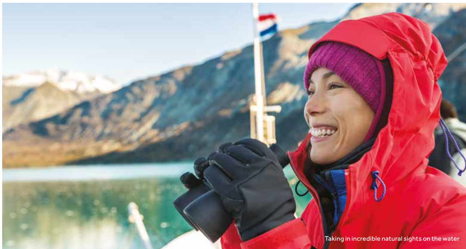
Taking in incredible natural sights on the water

Sail into the iconic Vancouver Harbour early this morning. After disembarking, take your transfer to Vancouver International Airport or to the Four Seasons Hotel Vancouver if you wish to extend your stay and explore more of this diverse city. Airport arrival will be at approximately 09:30. (B)